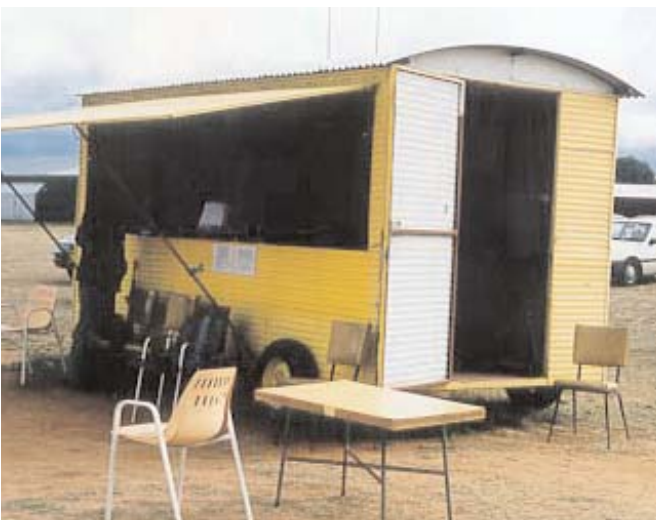
The pie-cart with new roof installed

In June, Mike Perry fabricated and installed the new curved roof onto the piecart. The new roof will keep the pie-cart waterproof, as it extends out beyond the edge of the pie-cart and its open windows. It will also keep the duty pilots and others inside warmer in winter and cooler in summer. Chris Bennett then installed new shelving to replace the old, splintered and water damaged shelves.